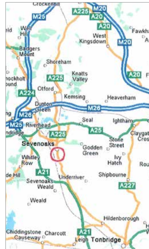
Map © Tele Atlas / © 2007 Crown Copyright

Fast trains run from London Charing Cross, London Waterloo East and London Bridge (approx. 30 minutes) as well as from the Channel Ports and Ashford International with its Eurostar connections. Sevenoaks Station is within walking distance (15–20 minutes) of the school and taxis are available at the station.