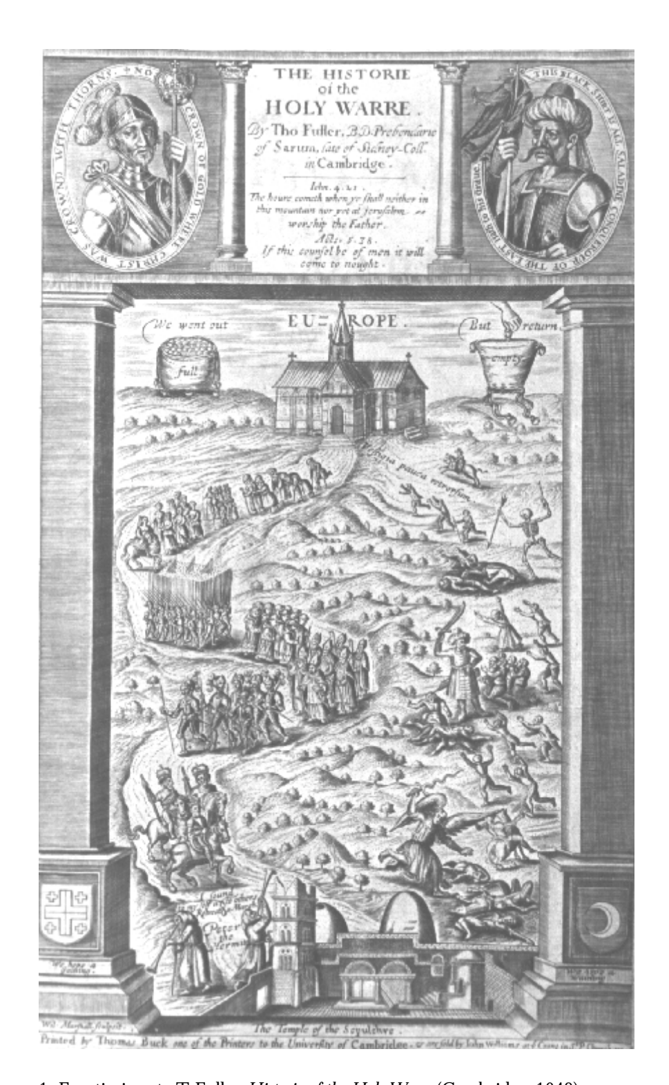
1 Frontispiece to T. Fuller, Historie of the Holy Warre (Cambridge, 1640)