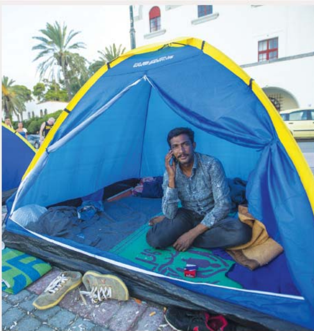
Figure 5 A migrant sitting in his tent on a Greek Island whilst on his mobile phone in September 2015

To what extent does this image illustrate patterns in global migration?